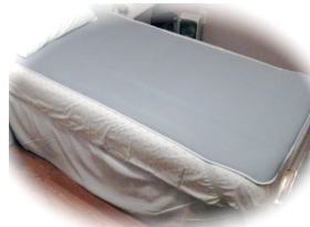
C – Full Mattress Pad Anchor with 4 Corners Elastics