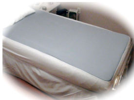
D – Full Mattress Pad Contour/Fitted