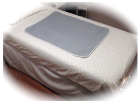
A – Regular Bed Pad