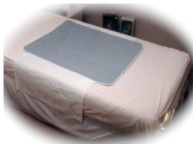
B – Regular Bed Pad with Wings